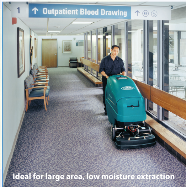
Ideal for large area, low moisture extraction